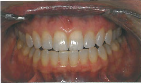
Teeth inadequately separated to highlight incisal edges