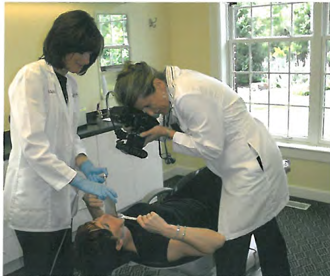
Occlusal views are aided by having patient reclined and holding retractors. An assistant holds an occlusal mirror against opposite arch and keeps mirror from fogging with a gentle stream of dry air. Photographer stands above the patient to capture the maxillary view and below the patient's head to capture the mandibular view.