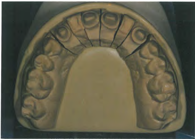
2. Occlusal view of prep model