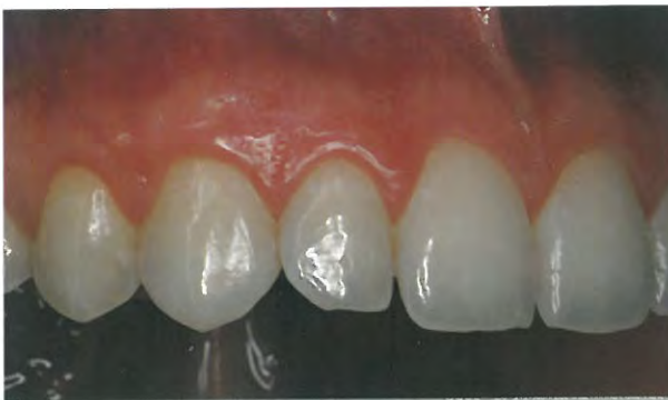
Correct framing without contrasting device