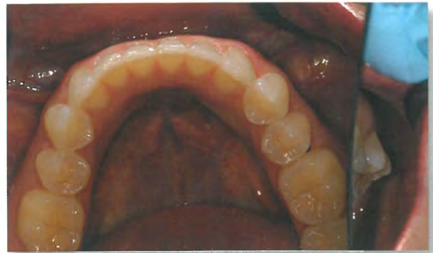
Improper framing – edge of mirror and unreflected teeth visible