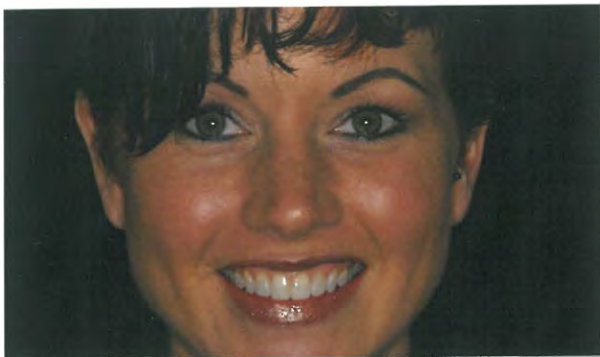
Excessive magnification for full face view