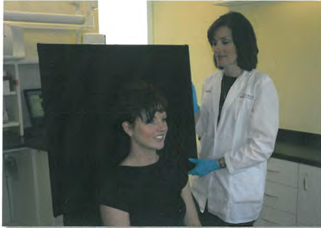
Use a solid background for full face images

Capturing exceptional photography often requires an extra set of hands. An assistant can optimally position retractors, dry the teeth as needed, hold mirrors when required and prevent the mirror from fogging by using a gentle stream of air.