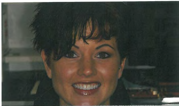
Full face image taken without a uniform backdrop