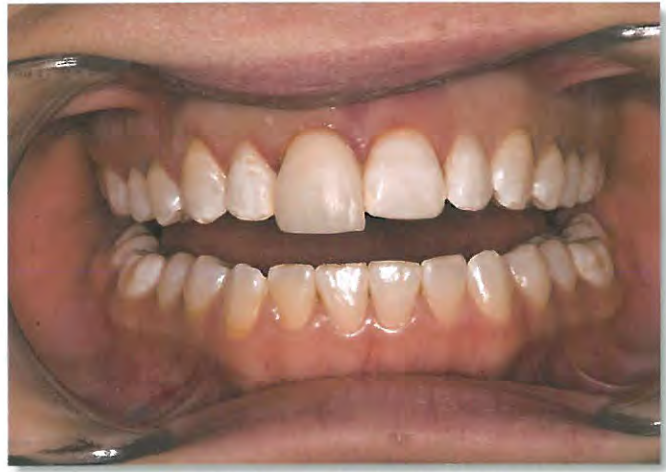
2. Initial layer of restorative resin (after curing, before contouring)