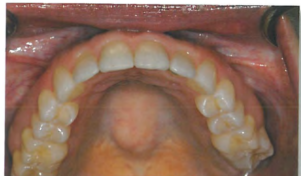
Improper angle – imaged taken from a facial perspective, without a mirror