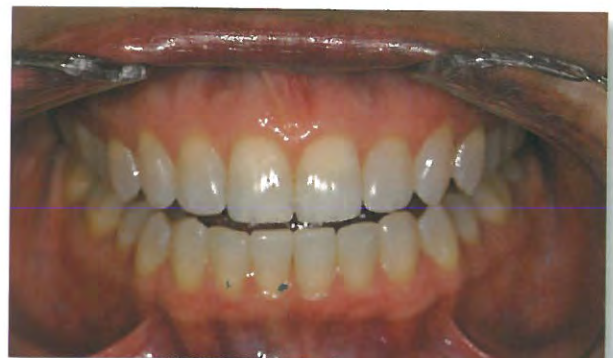
Lack of focus – image blurry