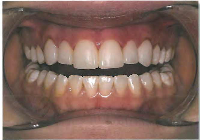
5. After contouring, but before polishing