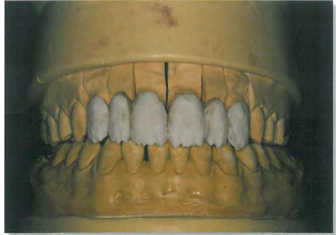
5. Frontal view of completed build-up before firing or processing