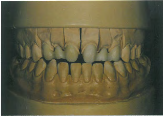
4. Frontal view of bridge framework or coping design before application of veneering material

These photos are to be taken at 1:2 (1:3) magnification or digital equivalent