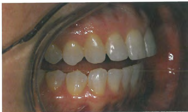
Improper angulation – lateral view should be exposed perpendicular to the lateral incisor