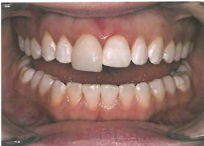
4. Final layer of resin (bulk layer, after curing, before contouring or finishing)