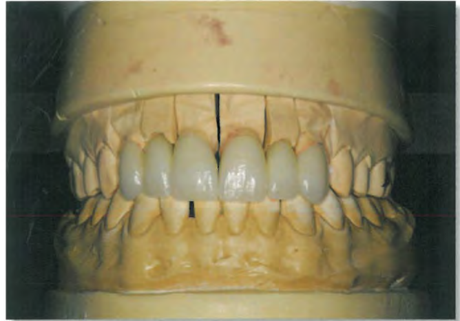
7. Frontal view of finished case on model