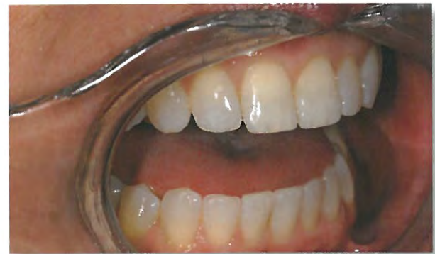
Improper framing and inadequate retraction