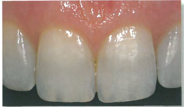
Excessive magnification for 1:1 (1:1.5) view