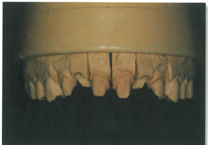
3. Frontal view of lab manipulated tissue site for Case Type III