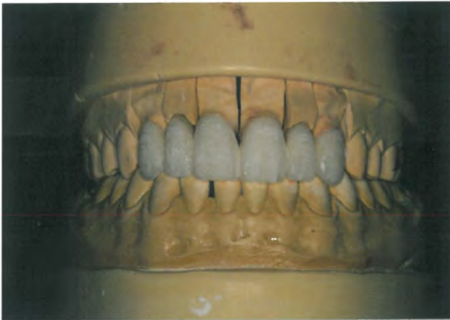
6. Frontal view of contoured bisque bake (show tissue adaptation on Case Type III)