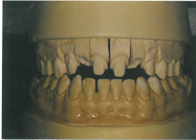
1. Frontal view of prep model in occlusion with opposing model

These photos are to be taken at 1:2 (1:3) magnification or digital equivalent