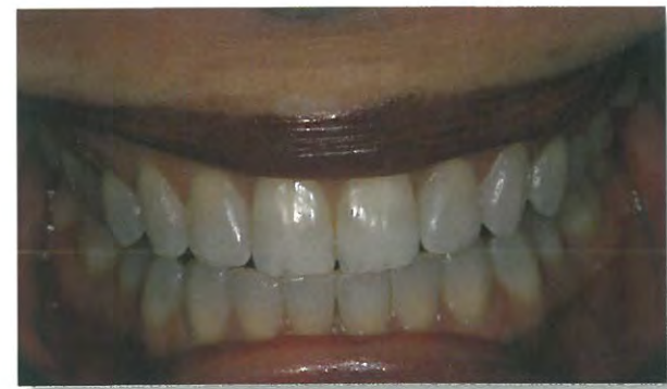
Inadequate retraction, superior angle and maxillary and mandibular teeth inadequately separated