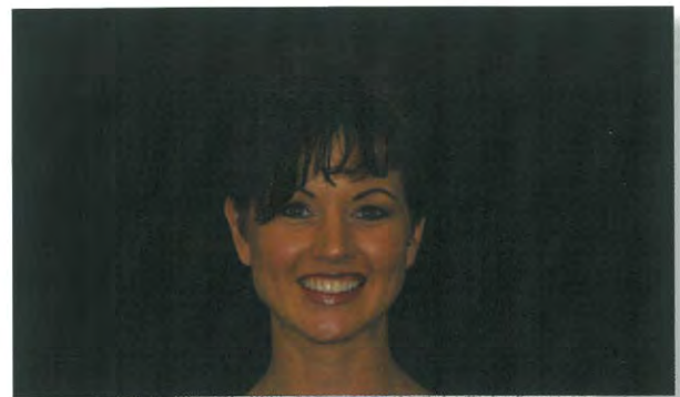
Inadequate magnification for full face view