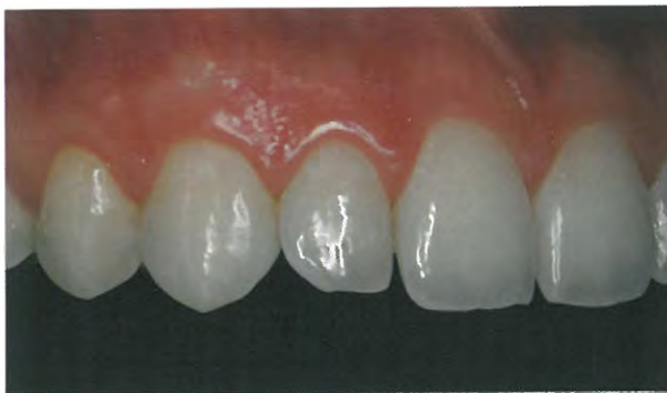
Proper framing and placement of a contrasting device