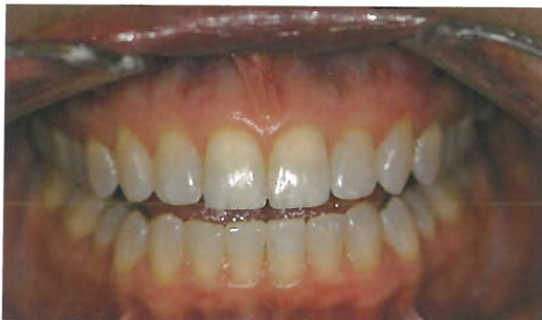
Anterior teeth are in focus but posterior teeth are out of focus. f-stop too low – improper depth of field