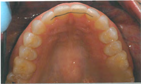
Unreflected teeth visible, fogging of mirror, debris visible in teeth