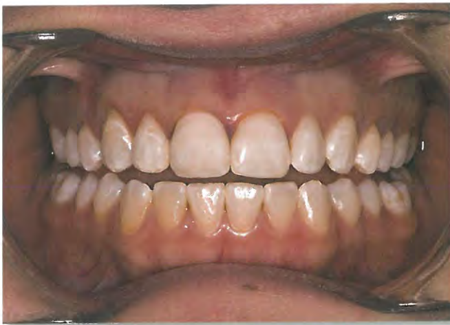
1. Initial preparation, beveling and/or abrasion of tooth surfaces